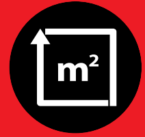
Same Specs as M2 & M3 for certificate module