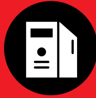
PC System For disassembly Multimeter/ Test pen/ System Cleaning Tools