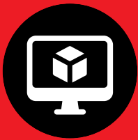
Windows 10/11 Virtual Box